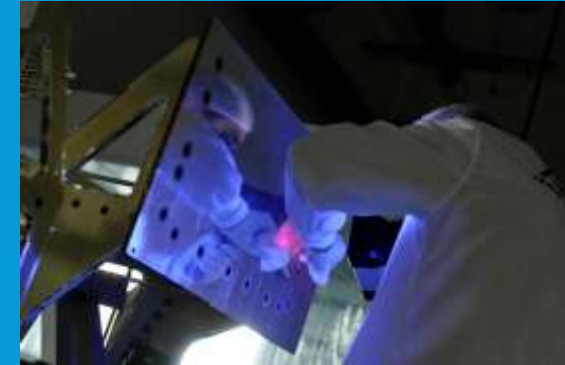
Above: SSM on Sentinel-3 SLSTR RA