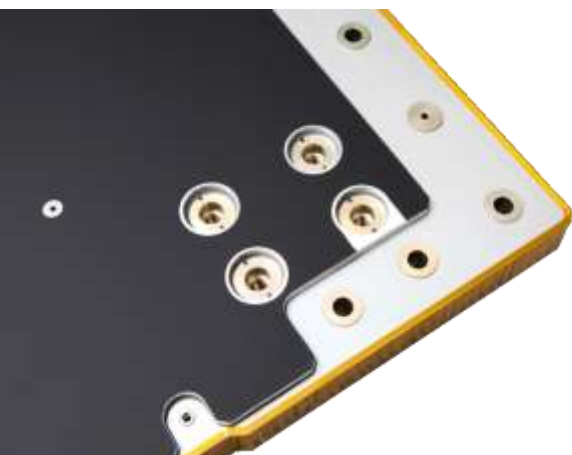
Sentinel - 5 P Panel External thermal doubler