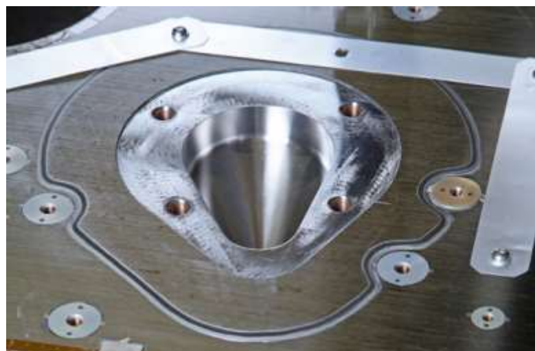
Sentinel - 2 MSI Structure - External structural doubler