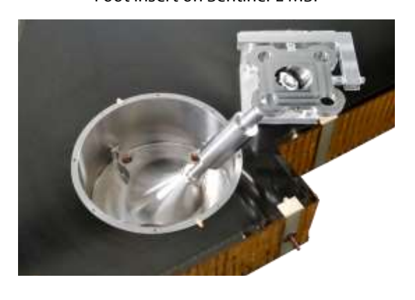
Foot insert on Sentinel-2 MSI