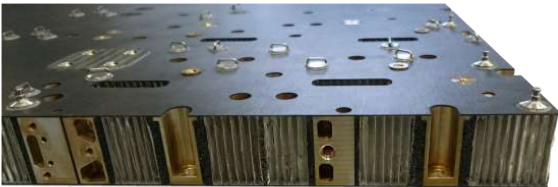
Hot-bonded edge inserts on EUI OBS