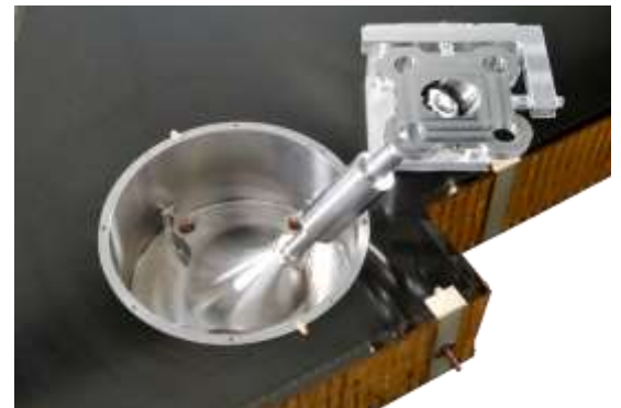
Foot insert on Sentinel-2 MSI