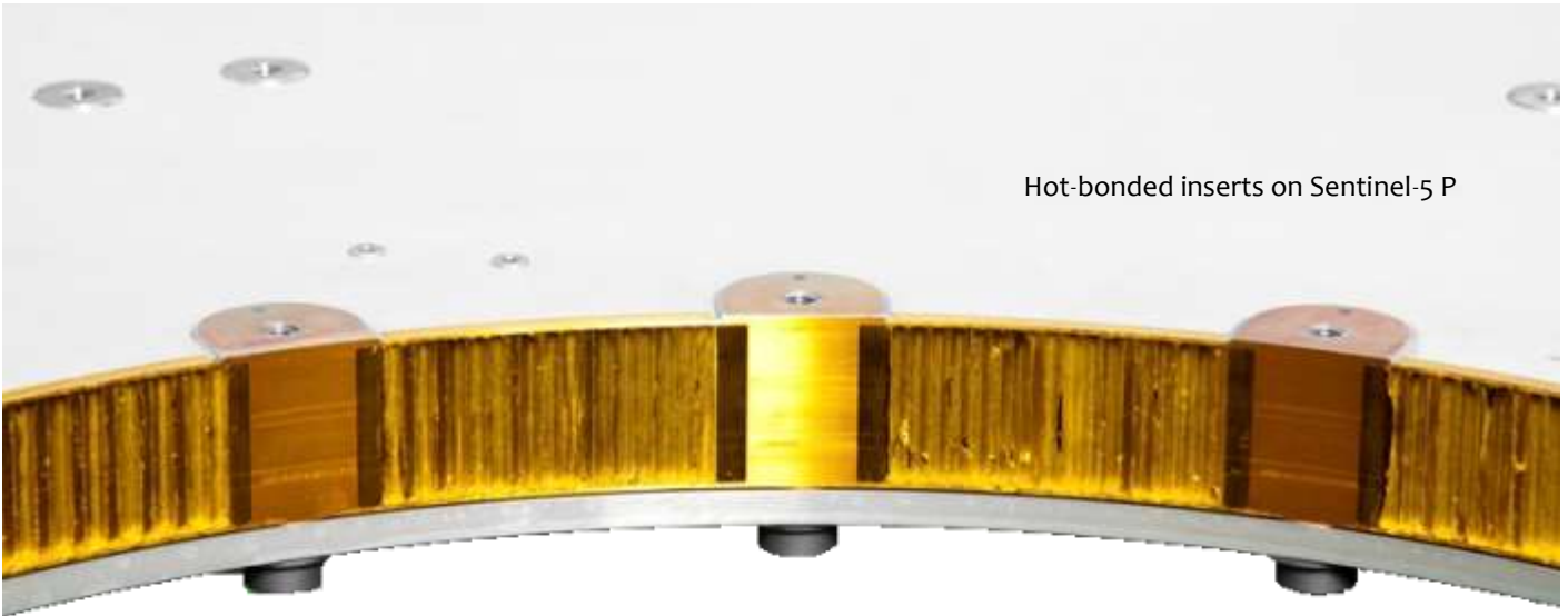
Hot-bonded inserts on Sentinel-5 P