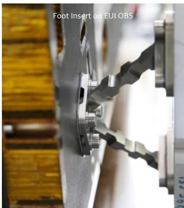
Foot Insert on EUI OBS